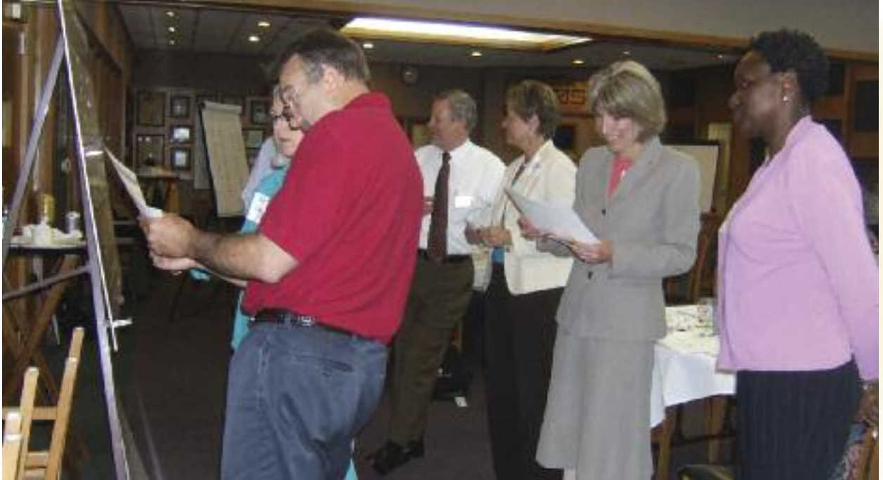
Community College Leadership doctoral students meet as part of new program.